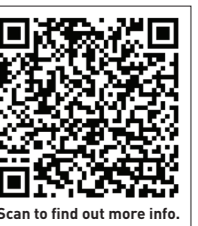
Scan to find out more info.

A SIMPLE CLICK & RESTORE IS ALL YOU NEED TO COUNTER RANSOMWARE!