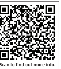
Scan to find out more info.

A SIMPLE CLICK & RESTORE IS ALL YOU NEED TO COUNTER RANSOMWARE!